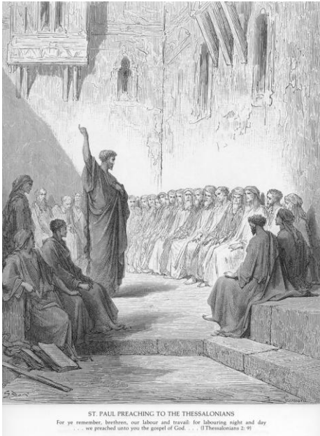
ST. PAUL PREACHING TO THE THESSALONIANS For ye remember, brethren, our labour and travail for labouring night and day ... we preached unto you the gospel of God. . . (I Thessalonians 2: 9)

The Lord had called the Apostle Paul to come into Europe and proclaim the Gospel there. Paul came eventually to the city of Athens which, I believe, is spiritually similar to America today. Paul found the men of Athens to be "religious in all respects" (Acts 17:22). He spoke to a group of philosophers there who liked to gather at a place called the Areopagus. He was actually invited there to present his views on religion. The Epicurean and Stoic philosophers he had some conversations with were intrigued by what he was teaching especially since he was speaking about the resurrection. Some simply called him an "idle babbler" (Acts 17:8), but since the Athenians liked to hear new things, they gave him an opportunity to speak to their assembly and city council at the Areopagus. Here, Paul boldly proclaimed to them, " ...you are ignorant of the very thing you worship " (Acts 17:23b ). He taught, unapologetically, the truth about the One true God, His love and provision for us through Jesus and how they were in error and needed to repent and believe in Him. Some believed, but others sneered. Paul, non-the-less was faithful! (Pictured left, Paul preaches in the European and Greek City of Thessalonica)