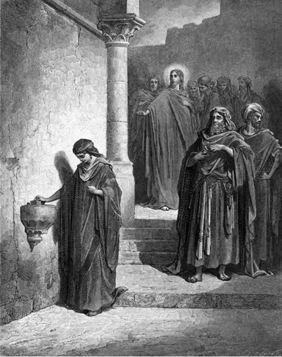
Jesus speaks of the widow giving her small gift at the temple, Mark 12:41-44

father and mother, and shall cleave to his wife: and they twain shall be one flesh? Wherefore they are no more twain, but one flesh. What therefore God hath joined together, let not man put asunder" (Matthew 19:4-6). The Lord's definition of family and marriage as well as God's design and intention for the husband and wife relationship is categorical, irrefutable, and irreversible.