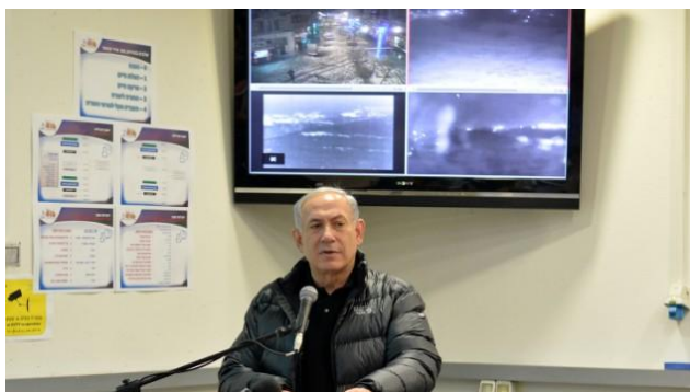
Prime Minister Benjamin Netanyahu at the Jerusalem City Hall's situation room during a briefing on the snowstorm which hit the capital on January 7, 2015.

BY TIMES OF ISRAEL STAFF AND AFP January 7, 2015, 9:09 pm 80