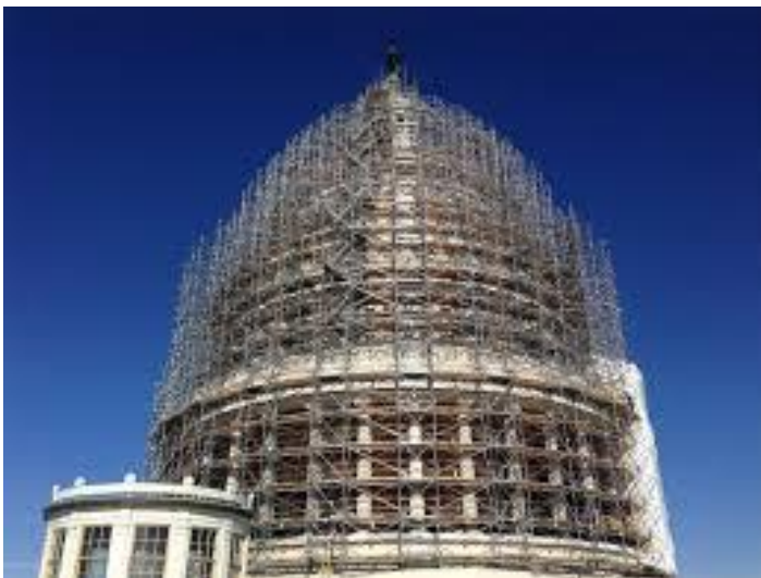
The Capital Dome with surrounding scaffolding for repair of damaged and structural weakness is analogous in appearance and inherent weakness to the original tower of Babel in the Bible. Departing from God, any nation will fall, along with its proud monuments. (Isaiah 9:9-11; Revelation 18:9-10)

This parable that Ezekiel gives to the Jewish exiles in Babylon also has an important personal application: Often, we do not like to stay in an uncomfortable spot. We try on our own to get out from under the consequences for our own unwise actions. But, it is better to wait on God and to yield to whatever He has in mind for us. We can take action, but only at His direction. The most important thing is to prayerfully listen to God through His Word and to be sensitive and surrendered to the promptings of His Spirit. ( Fearless Faith, A Study in the Prophecies and Precepts of Ezekiel , p. 106)