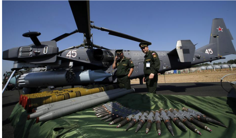
Ka-52 helicopter is on display during an event entitled "Innovations Day" organized by Russia's Western military command at Levashovo airbase outside St. Petersburg, June 6, 2014.

Russia plans to change its military doctrine this year because of recent developments in NATO strategy regarding Ukraine. Are these military games a show of strength and resolve for Russia to do what it thinks is in its own best interest?