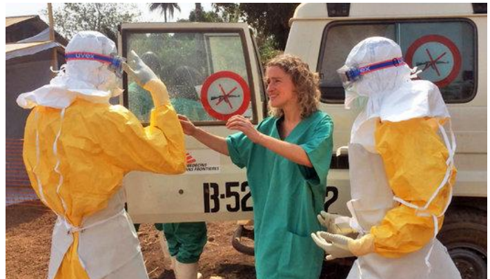
In this March 28, 2014 photo provided by Medecins Sans Frontieres (Doctors Without Borders), healthcare workers from the organization prepare isolation and treatment areas for their Ebola virus operations in Gueckedou, Guinea. One preacher advocated fasting and prayer to spare people from a virus that usually leads to a horrible death. Some people pray that the Ebola virus stays confined to a rural district. Others are unruffled and say the outbreak will blow over.