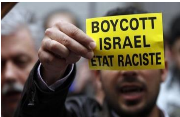
Man holds boycott Israel sign

By casting Zionism as racism on their official website, the elite running this Church have crossed a line that makes interfaith cooperation impossible.