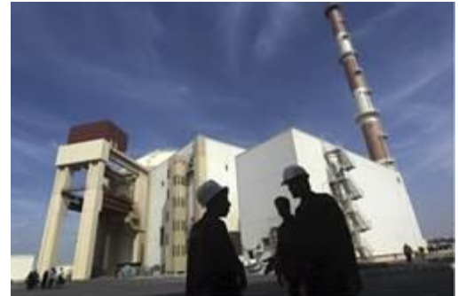
Iranian workers standing in front of the Bushehr nuclear power plant

As the United States relaxes sanctions against Iran in the wake of the agreement Tehran signed with Western powers, in which it promised to somewhat limit its nuclear development program, Iran's economy has gotten a major boost – without a commitment by the country to stop its production of enriched uranium.