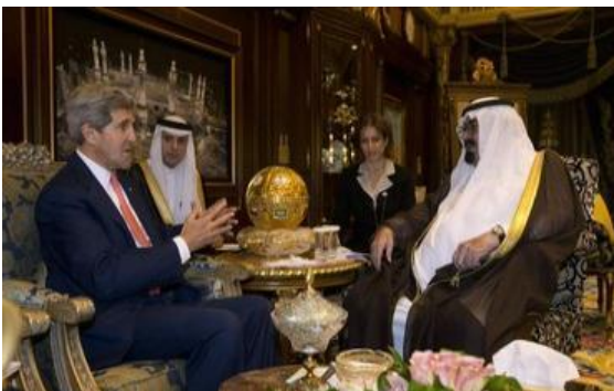
US Secretary of State John Kerry meets with Saudi King Abdullah

Recently, Israel sent officials into Saudi Arabia, reportedly to inspect potential staging sites for an attack on Iran. The recent U.S. and Obama led peace deal with Iran to relax sanctions in exchange for what Israel considers merely cosmetic changes in Iran's nuclear aspirations has brought increased tensions among Iran's potential targets. (See Prophecy in Perspective lead article, "Is History Repeating Itself," Vol. 59, 12-29-13) It is no surprise then, that Israel and Saudi Arabia, historical enemies, are now cooperating in a potential combined militarily stand against Iran.