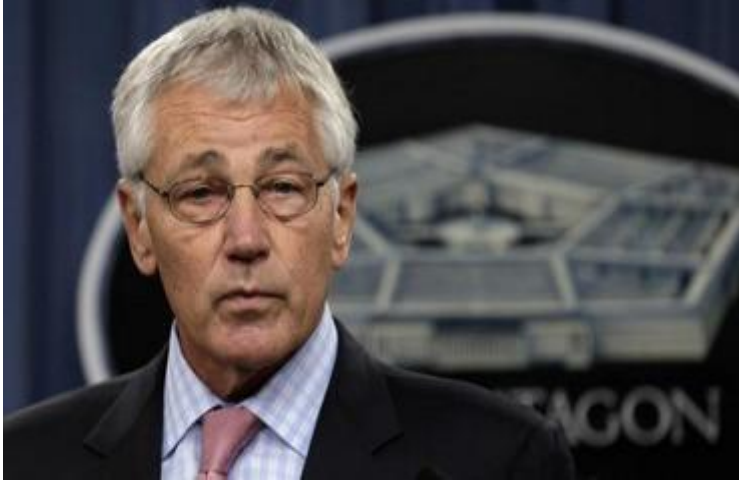
US Secretary of Defense Chuck Hagel at a press conference.

scandals, etc. I have pointed out before in Prophecy in Perspective articles that worldviews do matter in the affairs of a nation. It is important for citizens of any nation, and especially one like the U.S., to ask what is the world view of a political and judicial leader before they place them in office by their vote! Can America be trusted? Or is there a realignment of our support toward enemies of Israel? It appears that there is! The US Secretary of Defense, Chuck Hagel's, support for Israel is questionable at best. In the following article, in a speech to Gulf leaders in a meeting in Bahrain, Hagel tries to assuage their deep concerns about whether America can be trusted as an ally.