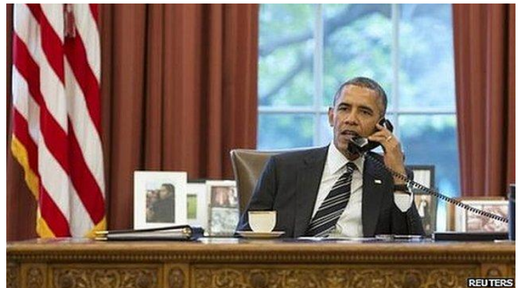
( http://www.bbc.co.uk/news/world-middle-east )

But what we do know is that Iran is not to be trusted. Their "new tone" is likely hiding their announced goals and desires: the destruction of Israel and America. The Bible predicts that in the latter days one will arise whom Daniel calls, " the Prince that shall will come. " He will arise through deceiving the nations into believing that He brings a "new tone" to the peace table. Many nations, including Israel, will be taken in by him (Daniel 9:26-