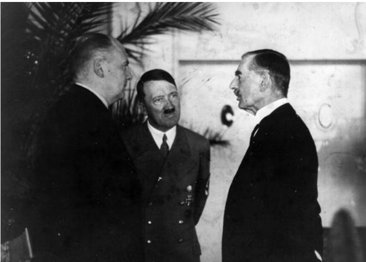
British Prime Minister Neville Chamberlain, right, speaks to Adolf Hitler's interpreter Paul Schmidt during their meeting at the Hotel Dreesen at Godesberg, Germany, in September 1938. Days later, Chamberlain signed a peace agreement that, though reviled in retrospect, was his best choice at the time. ( http://www.slate.com/articles/news_and_politics/foreigners/2013/09/13 )