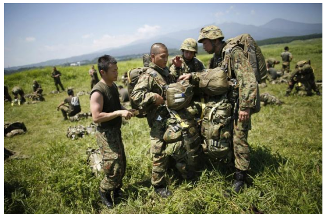
Japanese paratroopers during recent military exercises

"Some of China's activities involve its intrusion into Japan's territorial waters, its violation of Japan's territorial airspace and even dangerous actions that could cause a contingency, and are extremely regrettable," the paper said. Japan said in February