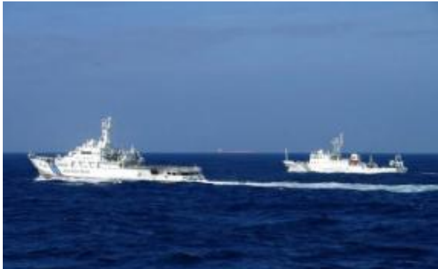
A Chinese marine surveillance ship (R) alongside a Japan Coast Guard vessel near disputed islets on

The report was harshly critical of China's actions in waters near East China Sea islets claimed by both countries, and prompted a sharp response from Beijing, where a foreign ministry spokeswoman said Japan was exaggerating the threat to "artificially create regional tension and confrontation."