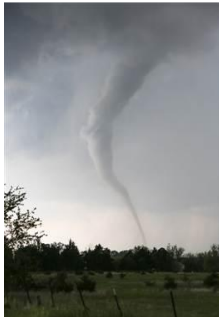
An unusual outbreak of tornadoes devastate areas of Oklahoma

The Lord has a purpose in revealing His anger in the Latter days. While many today deny that God is angry at sin, and while many have even redefined sin practically out of existence, the Bible is very clear about both God's anger and about sin. In fact, the title for this article is a direct quote from the Prophet Jeremiah 23:20 which states: "The anger of the Lord will not turn back until He has executed and performed the thoughts of His heart. In the latter days you will understand it perfectly." There are at least two very important things that we should realize from this one verse: First , God is angry at sin and He will carry out His judgment against