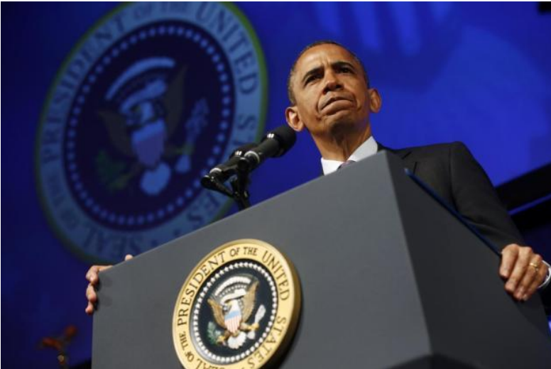
President Obama speaking to and praising Planned Parenthood

unborn and those already born and who were cruelly murdered by Gosnell and others! But, then President Obama, in a recent speech, was also enthusiastic in encouraging Planned Parenthood, America's leading industry of death, to carry on in their gruesome work of abortion. Humanist-Socialist-Leftism is truly the worst killer-cult of world history, matching the days of iniquity just prior to the time of Noah. The list goes on and on that enumerates the events and the massive rise of violence against the innocent around the world. Then there is the incredible spiritual deception that is growing everywhere and bringing religious and satanic confusion into prominence before us. (1 Timothy 4:1f; Revelation 17) These are evidences of God's judgment. And the rise of these occurrences and events certainly should make us more and more aware of the approach of the coming of the Lord Jesus Christ!